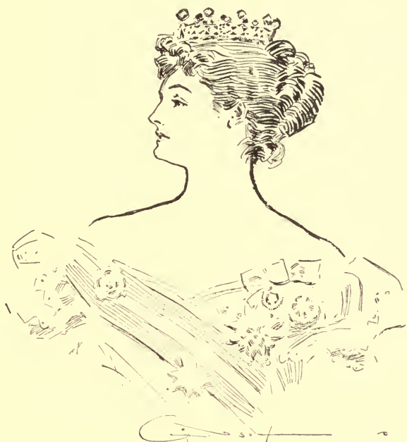
The Princess Aline of Hohenwald.